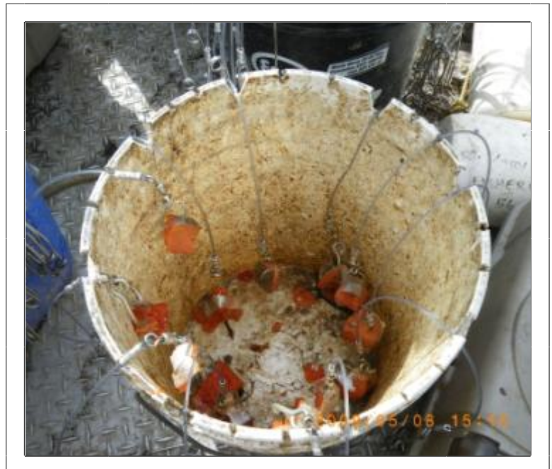
Set lines with Sockeye bait.

As with previous year's work, 2008 was again a very successful year, with a total of 70 sturgeon captured during the brood program. Sixty-two adults and 8 wild juveniles were caught and tagged between April 29 and May 31. Thirty-four of these fish were recaptures and 36 were previously not caught. A total of six ripe females and four ripe males were captured, and of these fish caught, five females and four males were transported to Prince George for spawning. Of these nine fish, four females and three males were used for the conservation fish culture program. Twenty new radio transmitters were applied to track both wild sturgeon spawners and untagged sturgeon used in conservation fish culture.