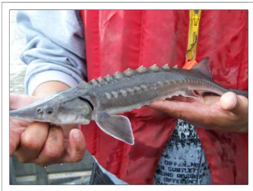
Raised as part of the 2006 conservation fish culture program, this juvenile was recaptured in the fall of 2008.

A total of 5 white sturgeon were captured ranging in length from 34cm to 103cm (total length). One of these fish was a conservation fish culture-reared juvenile that had been released in the fall of 2006. This was the first recapture of a fish culture-reared juvenile and the fish appeared very healthy at 49cm in length and just under 400g. A total of 5 of the 29 acoustic tags implanted in fish culture-reared juveniles released in the fall of 2007 were detected in the summer of 2008.