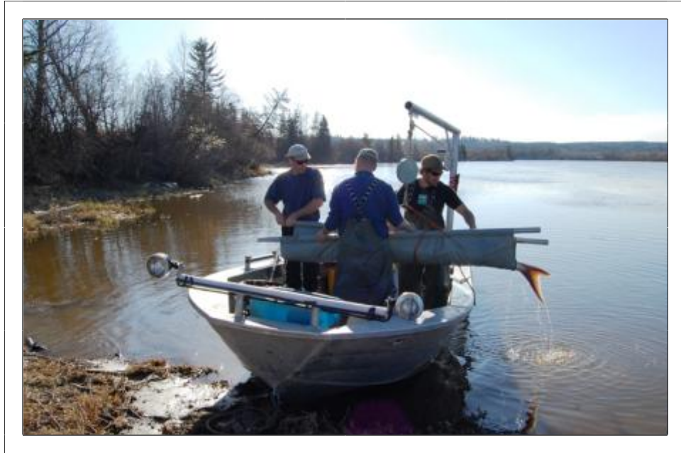
Adult sturgeon being assessed as potential 2008 broodstock.

From 1994 to 1999, the Province of British Columbia coordinated an intensive study of white sturgeon in the Nechako River. The study came to an unwelcome conclusion - the Nechako white sturgeon are in a critical state of decline. Unless something is done, and done soon, these great creatures will become extirpated.